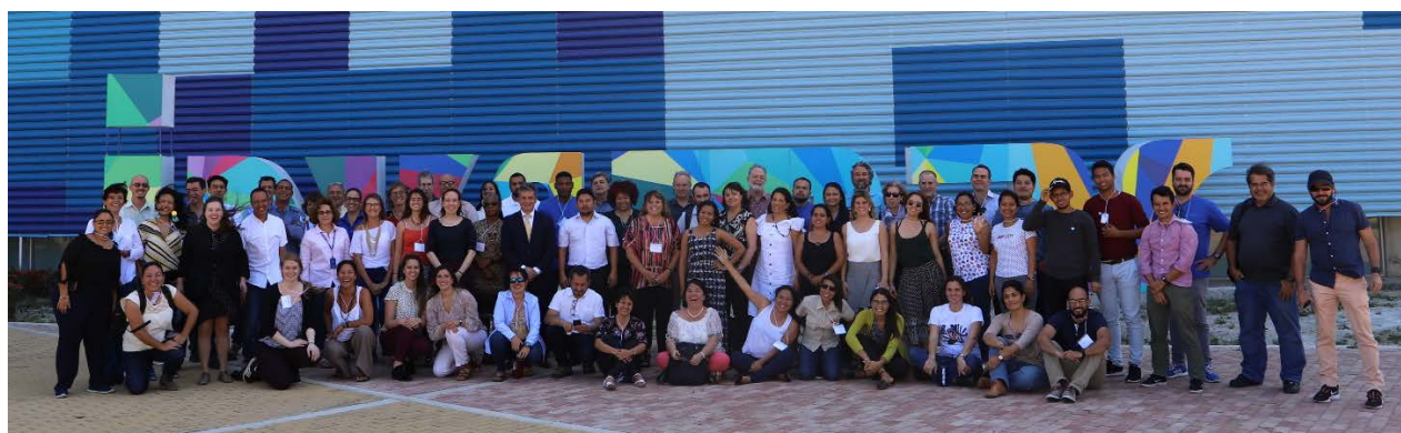
Participants in the Latin America and the Caribbean Regional Symposium on Ocean Acidification at INVEMAR, Santa Marta, Colombia

This month's Pier2Peer feature highlights the Latin America and the Caribbean Regional Symposium on Ocean Acidification , which was hosted by the Ocean Foundation from 21-24 January 2019 at Instituto de Investigaciones Marinas y Costeras (INVEMAR) in Santa Marta, Colombia. The event was organized with support from GOA-ON, the Latin American Ocean and Coastal Acidification (LAOCA) regional hub, the U.S. Department of State, the Swedish International Development Agency, and the Intergovernmental Oceanographic Commission of UNESCO (IOC-UNESCO). sessions on science, policy, and industry-relevant aspects of ocean acidification. More than 80 participants from 15 countries attended the symposium, which brought together scientists, policy-makers, and industry professionals from around the region to collaborate and discover strategies for building resilience to ocean acidification.