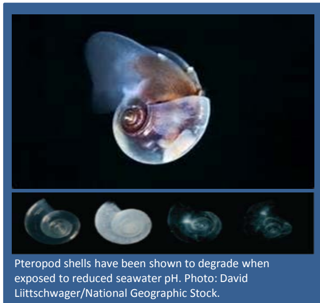
Pteropod shells have been shown to degrade when exposed to reduced seawater pH.

GOA-ON must be implemented at global through local scales to ensure that regional issues are addressed. The coordination of OA observing efforts within “regional hubs” serves to define regional science and policy needs for GOA-ON data and products, as well as enhancing global coverage.