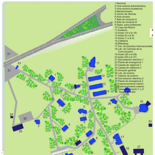
Universidad del Mar -Huatulco Campus Map www.umar.mxrv_huatulco_campus.html