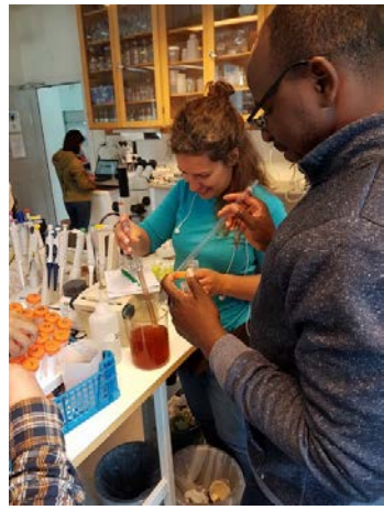
Conducting laboratory experiments during the University of Gothenburg training